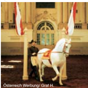
Österreich Werbung/ Graf H.