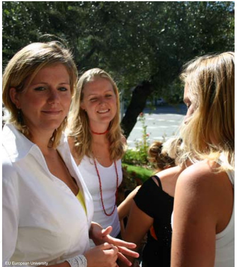
EU European University